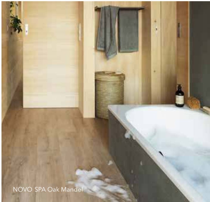
NOVO SPA Oak Mandel