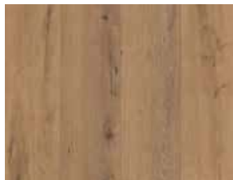
OAK SAVANNE unbevelled, brushed, Twist PLUS varnished