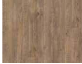
OAK MONTBLANC bevelled (4V), synchron, Twist PLUS varnished