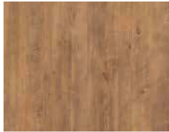
OAK COGNAC bevelled (4V), synchron, Twist PLUS varnished