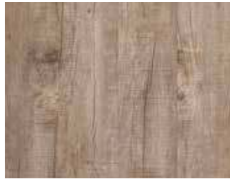
OAK STONWASHED unbevelled, brushed, Twist PLUS varnished