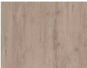
OAK MANDEL unbevelled, brushed, Twist PLUS varnished