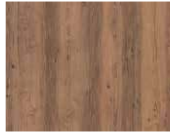
SPRUCE HASEL bevelled (4V), scraped, Twist PLUS varnished