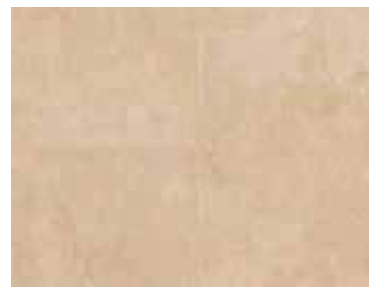
MARBLE NATUR bevelled (4V), wave, Twist PLUS varnished