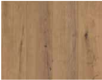
OAK SAVANNE unbevelled, brushed, Twist PLUS varnished