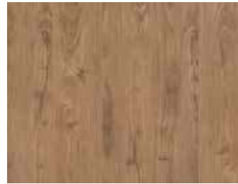
CHESTNUT BALTIC unbevelled, brushed, Twist PLUS varnished