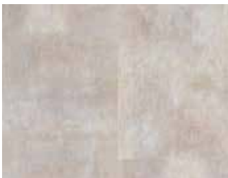
MARBLE MACARENA bevelled (4V), wave, Twist PLUS varnished