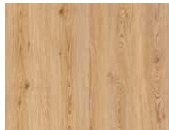
LARCH NATUR unbevelled, brushed, Twist PLUS varnished