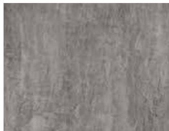
CONCRETE NATUR bevelled (4V), wave, Twist PLUS varnished