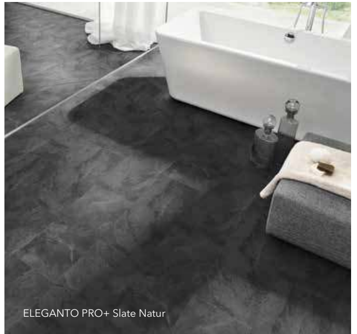
ELEGANTO PRO+ Slate Natur