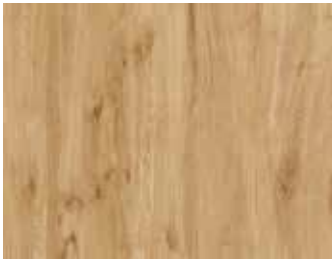
OAK NOX unbevelled, brushed, Twist PLUS varnished