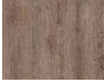
OAK WESTSIDE bevelled (4V), synchron, Twist PLUS varnished