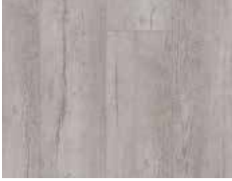
OAK VINTAGE bevelled (4V), synchron, Twist PLUS varnished